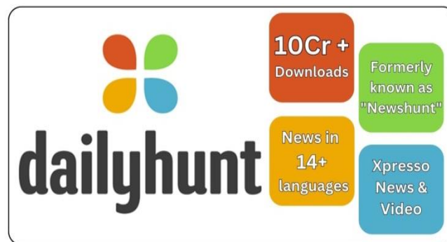
Figure 3: Logo of daily hunt with some key features