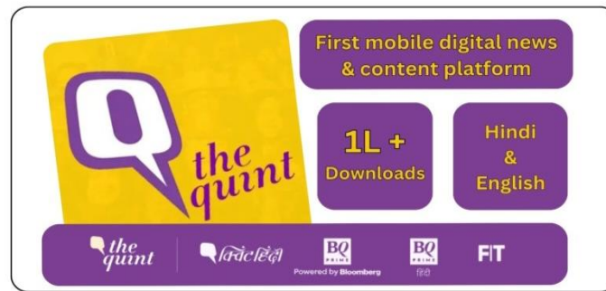
Figure 2: Logo of the quint with some key features