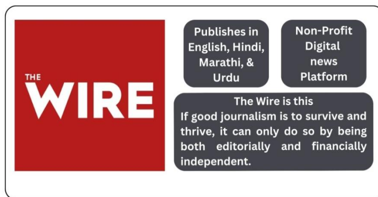
Figure 5: Logo of the Wire with some Key Features