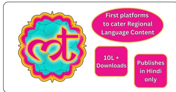
Figure 6: Logo of Lallantop with some key features