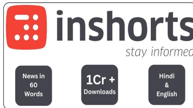
Figure 4: Logo of in shorts with some key features

in the Indian media industry through its innovative approach to news aggregation and delivery.