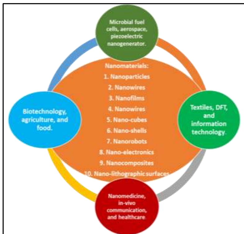
Figure 2: Various nanoparticles and their applications [13].

batteries). Researchers may solve concerns such as electrode degradation, energy density, electrolyte breakdown, and membrane fouling through the production of nanostructured metals.