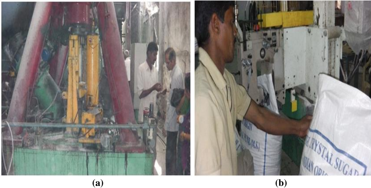
Figure 1: (a) and (b) -Sugar processing unit at baramati agritourism farm- pune

Rural tourism and agritourism are two concepts that are closely related. Rural tourism typically includes activities related to living in the country, its culture, religion, and everything else that is understood through ethnography, in addition to farm production and processing. Agritourism refers to tourist visits to farms and ranches in small towns that are well-prepared with packages that include activities in rural regions and excursions to food processing facilities.