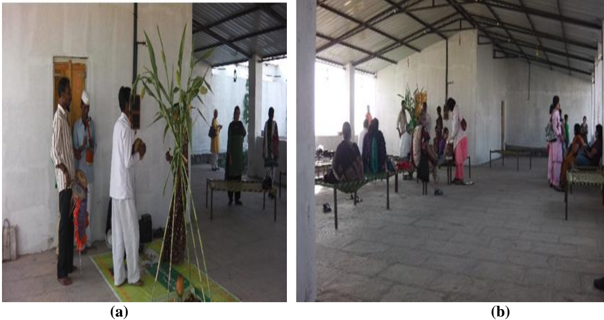
Figure 2: (a) and (b) Local rituals and food service at govind bag- agritourism farm-pune