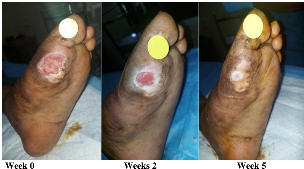
Figure 5: An ulcer in the plantar aspect of the left foot at the 1st MPJ. Debridement was done, dressing done as per FS protocol, front offloading footwear provided. Dermal patch applied.

11. Modern Surgical Treatment Options Directed towards Limb Saving: Several studies have investigated the efficacy and safety of unilateral Tibial cortex transverse transport (TTT) on bilateral diabetic foot ulcers. The results showed that TTT effectively alleviates the pain of diabetic foot ulcer patients, promotes wound healing, and improves ankle-brachial index and peripheral nerve recovery.