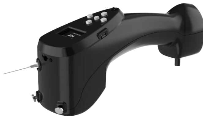
Figure 1: NEURO TOUCH multi parameter diagnostic device.