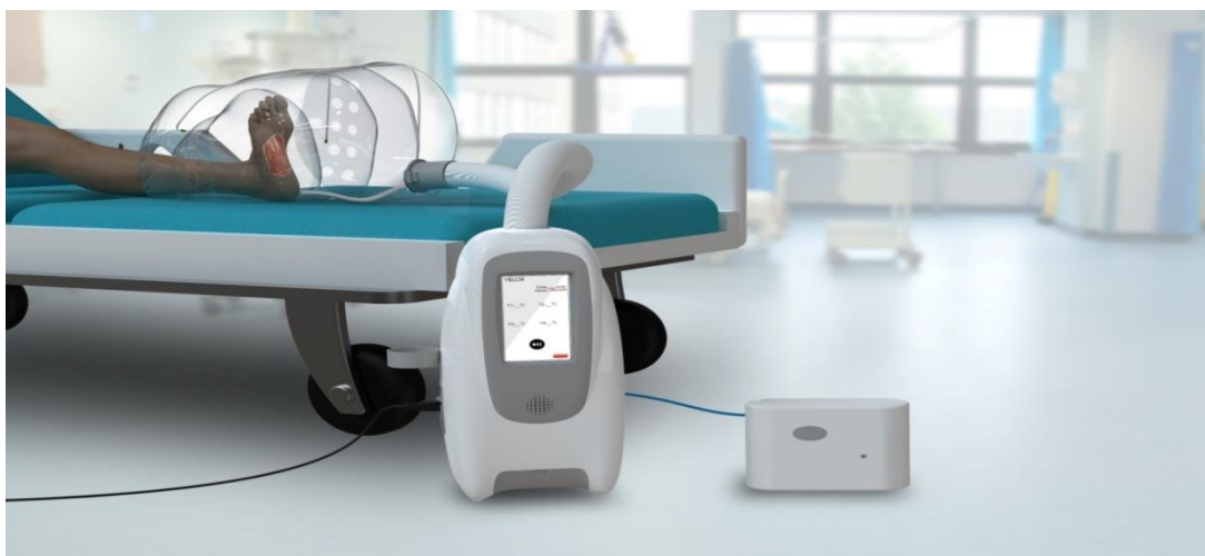
Figure 2: Velox Topical warm oxygen therapy