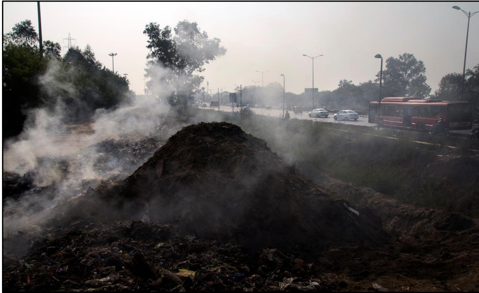
Figure 2: A Picture of a Huge Pile of Garbage Burning on the Side of the Road around New Delhi

The use of some novel chemicals/materials in the industry for advanced technology poses health risks to workers and cannot disintegrate quickly. Acids, heavy metals, and oils are released from solid waste and can change the soil's fertility (Bhardwaj et al. 2023e). Solid waste contributes to global warming mostly through the release of greenhouse gases like carbon dioxide (CO 2 ) and methane (CH 4 ) (IPCC 2006; Bhardwaj 2023b). CH 4 is released when biodegradable garbage decomposes under anaerobic conditions in landfills while CO 2 is released after the burning of fossil fuels (Barlaz et al. 2009; Andres et al. 2012).