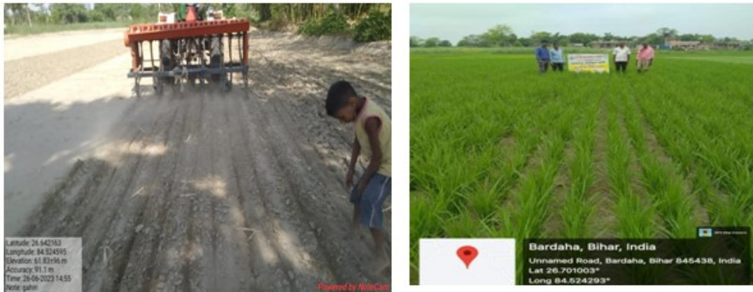
Figure 4: Inclined Plate Planter & DSR technology Paddy crop