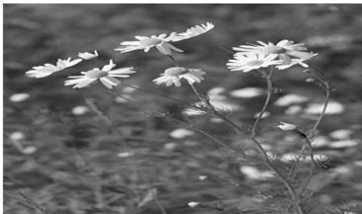
Figure 4: Chamomile.

2. Chamomile: Any of the several daisy-like plants belonging to the aster family (Asteraceae), are also spelt as chamomile. English, or Roman, chamomile ( Chamaemelum nobile ), or German chamomile ( Matricaria chamomilla ), are the two varieties used to make chamomile tea, which is used as a tonic, an antibacterial, and in many herbal treatments. Numerous kinds, particularly golden marguerite or yellow chamomile ( Cota tinctoria ), are used as garden ornamentals. Acne outbreaks can be treated with chamomile. It reduces inflammation brought on by acne by acting as an anti-inflammatory. Long used as a main component in calming skin care products, chamomile. Even the ancient Greeks and Egyptians used crushed chamomile flowers to soothe their skin's redness and dryness caused by the weather. Many plants belonging to the Anthemis genus, which includes more than 100 species of Eurasian herbs, are also referred to as chamomile. They have yellow or white disc blooms and yellow ray flowers in small flower heads as a distinguishing feature. Mayweed, often known as stinking chamomile ( A. cotula ), is a pungent weed that has been employed as an insecticide and a drug.