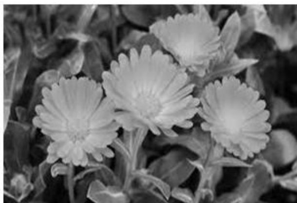
Figure 3: Calendula

The marigold plant is the common name for the Asteraceae family member Calendula officinalis . It is applied topically as a suspension or tincture to treat acne, lessen swelling, stop bleeding, and soothe sensitive skin. Radiation dermatitis can be effectively treated with calendula cream or ointment. Calendula is a native of Canada and the lower 48 states, according to the United States Department of Agriculture (USDA). An annual flower, calendula is simple to grow on ordinary, moderately fertile, well-drained soils that receive direct sunlight. It is suitable for planting in flower beds, borders, cottage gardens, cutting gardens, as well as pots and containers. The plant's fragrant leaves in a garden draw butterfly. The petals are a common ingredient in floral arrangements and potpourri mixtures. They can be prepared and consumed as well.