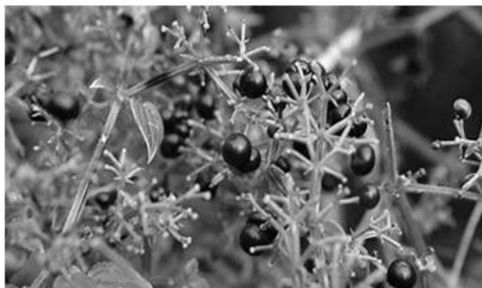
Figure 7: Manjistha