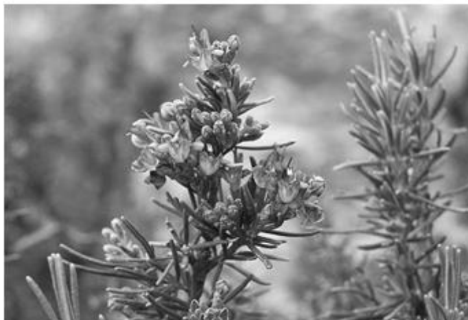
Figure 5: Rosemary

3. Rosemary: An aromatic evergreen herb, rosemary is indigenous to the Mediterranean. In addition to being used as a culinary seasoning, it is also used to manufacture body fragrances and may have health advantages. It belongs to the Lamiaceae mint family, which also includes many other herbs like oregano, thyme, basil, and lavender. The essential oil from the rosemary plant is rosemary extract. In addition to being used in aromatherapy and beauty items, rosemary essential oil is also employed in dietary supplements. For generations, people have used rosemary as a natural remedy for conditions like arthritis, asthma, stomach cramps, and many more. It is employed by people as a natural antiseptic and antifungal. It is used to improve the state of the skin and is thought to have anti-aging qualities. Because it can withstand droughts, rosemary thrives in warm climates like its native Mediterranean coasts. Under these circumstances, rosemary can develop into a 5 to 10-foot-tall bush. In fact, rosemary requires annual trimming to keep it bushy since it grows so quickly under optimal circumstances. You can grow this herb either in the ground or in a pot. It grows readily as a perennial evergreen shrub that lasts for many years if you reside in Zones 7 and warmer. Although rosemary is hardy down to 15 to 23°F (-10 to -5°C), it could need protection throughout the winter. Rosemary should be planted in a pot and taken indoors for the winter in colder climates.