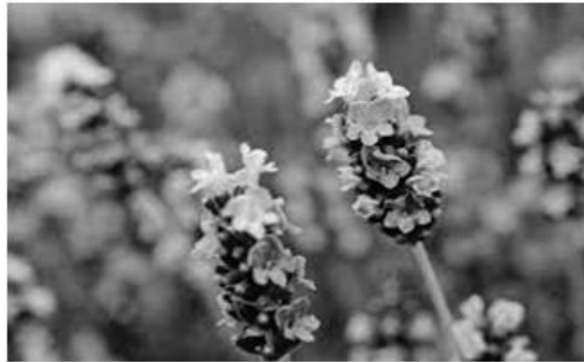
Figure 6: Lavender