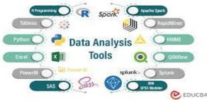
Figure 2: Data Analysis Tools