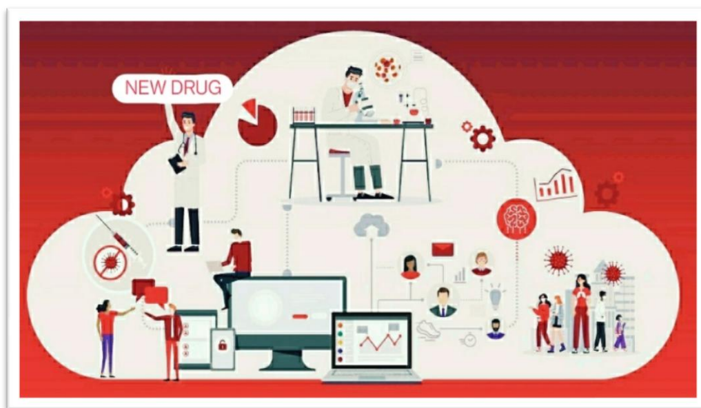
Figure 1: Digitalization Fastening the Process of Drug Discovery