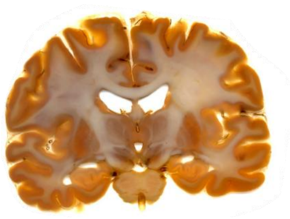
Figure 1: Coronal section of the human brain (sheet plastination). Polyester (P40) technique [3].