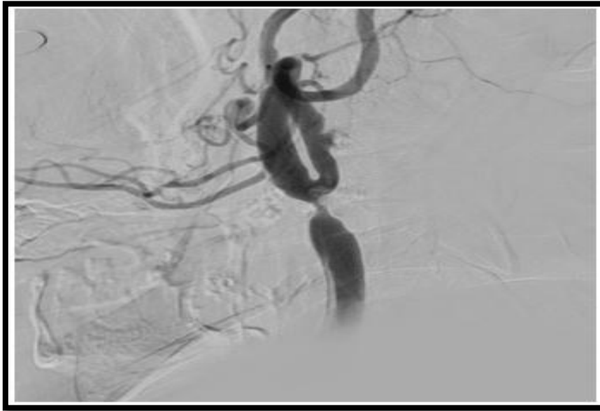
Figure 2: Digital subtraction angiogram of common carotid artery lateral view, depicting significant stenosis in the distal CCA