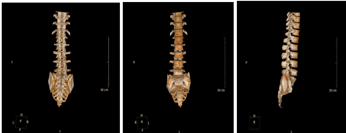
Figure 3: Reformatted 3D images of the Lumbosacral vertebral bodies (gives a better understanding)

Rapid thin-section CT and isotropic MRI collections enable 3D post processing, an established technology. All human parts and systems can be imaged using three-dimensional post processing, and the majority of contemporary PACS can offer basic three-dimensional capability such the creation of MIP images and multiplanar reformatted images.