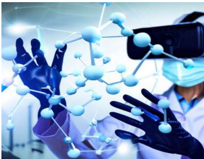
Figure 2: Visualization of a Chemist Interacting With A Molecular Structure in A Digital Environment

A collective virtual shared space created from the convergence of virtual augmented physical reality and permanent virtual reality, the metaverse provides a unique platform for uniting these disciplines. In the context of designing and exploring virtual molecules, the metaverse serves as an immersive environment for chemists, and researchers to interact with molecules on a scale that transcends the limits of the physical world. The Mateverse platform, based on Metaverse technology, makes all of this possible through a digital process supported primarily by human researchers, which will drastically change the research paradigm in chemistry. Metaverse is a technology that should not be overlooked for the future development of chemistry driven by integrated data from experiments, simulations and theory.