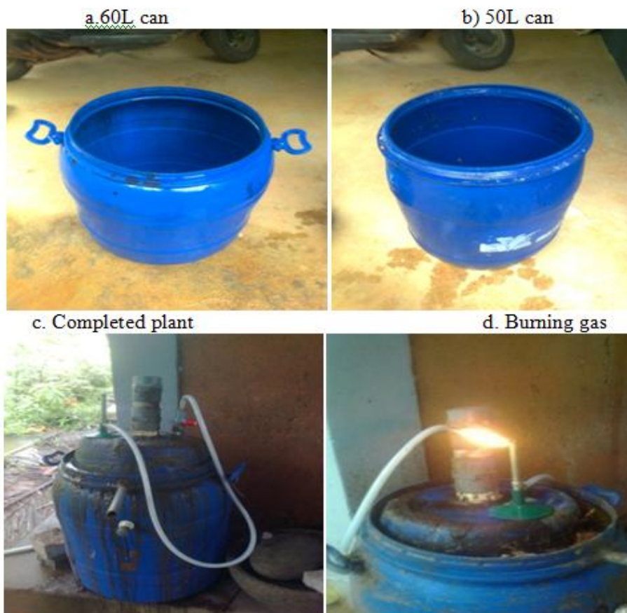
Figure 1: Different stages of bio gas plant