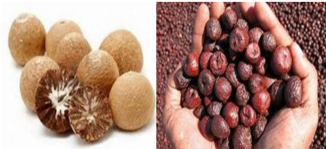
Figure 3: Partially Processed and Completely Processed Arecanut

Figure 2.demonstrates an unprocessed, raw arecanut. Raw arecanuts are either ripe or delicate nuts that still have their outer shell on. For marketing purposes, these raw arecanuts must be processed. Even the nuts' outer shells are valuable and can be utilized for a variety of things. Numerous researchers are engaged in it..