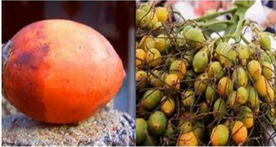
Figure 2: Raw Arecanut

Figure 2.demonstrates an unprocessed, raw arecanut. Raw arecanuts are either ripe or delicate nuts that still have their outer shell on. For marketing purposes, these raw arecanuts must be processed. Even the nuts' outer shells are valuable and can be utilized for a variety of things. Numerous researchers are engaged in it..