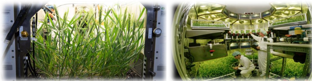
Figure 3: Controlled-environment agriculture (CEA) technologies

The benefits of CEA technologies, include increased crop yield annually due to quicker culture period under ideal environmental conditions and year round cultivation, greater growing area per m 2 through multi-tier cultivation shelves and more plant density, efficient nutrient and water use, lessened crop losses, and absence of pesticide application, make them effective for crop production. Additionally, these technologies might result in the production of typical, high quality horticultural goods. Closed and interior plant cultivation, in contrast to outside agriculture, rely on cutting-edge light sources like LEDs that can stimulate plant growth while significantly lowering energy use.