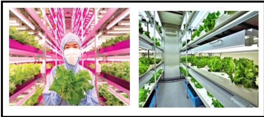
Figure1: Lettuce Production using Grow Light

According to Hikosaka et al. [7], tomato plants with one and two leaves exposed to supplemental LED lighting had photosynthetic rates that were 12 per cent and 28 per cent greater than the control (only top lighting)