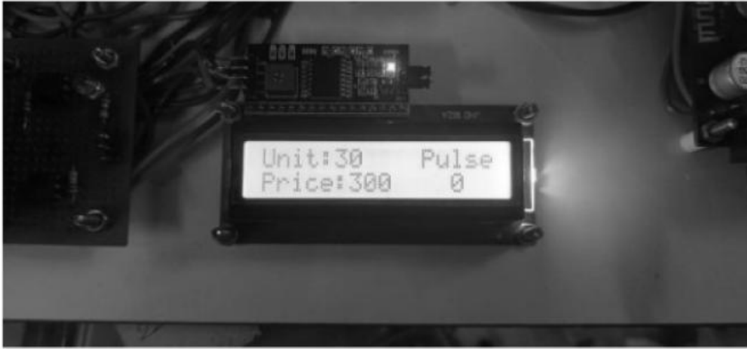
Figure 3: Measure Balance