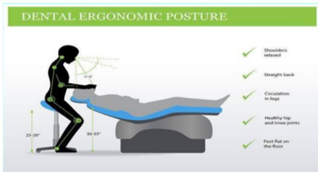
Figure 2: Dental Ergonomics

Ergonomics is the science of design that adapts work to the worker. The application of dental ergonomics increases the comfort of the dental team and reduces work-related disturbances. Dentists often suffer from lower back, neck and shoulder pain, wrist and hand problems, stress, etc. They are the result of awkward posture, heavy loads, repetitive motions such as shaking and vibrating hand tools. These problems can be solved by using proper working positions, shadow-free lighting and placing equipment and materials in a way that minimizes postural deviations during work.