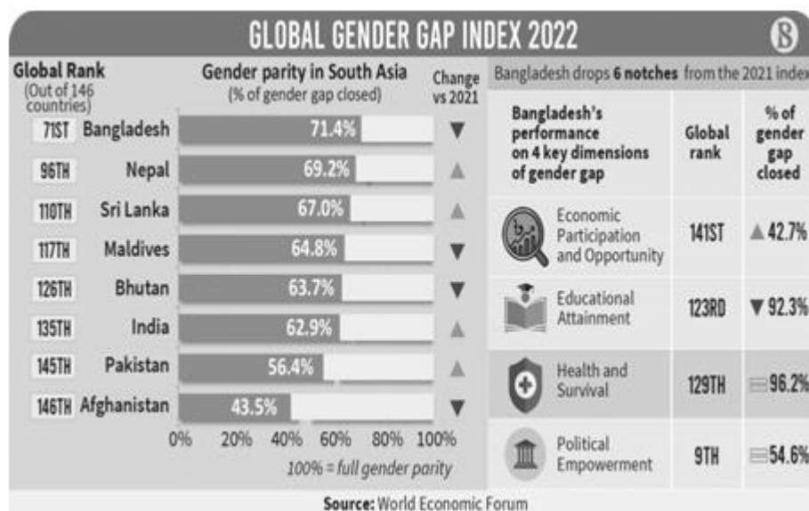
Figure 1: Global Gender Gap Index

The Gender difference in India is more in contrast to other countries. The gender gap index is one in multi-dimensional measures of gender disparity. India turned into scored at 0.67 by the WEF, and ranked 135 out of 146 international locations in 2022. Understanding gender inequality necessitates acknowledging the inter sectionality of various forms of oppression. It is crucial to consider how factors such as race, class, ethnicity, sexual orientation, and disability intersect with gender, resulting in compounded forms of discrimination and disadvantage. Efforts to address gender inequality involve promoting gender equity, challenging discriminatory practices and norms, advocating for policy changes, fostering inclusive education, promoting women's leadership and representation, and combating gender-based violence. Achieving gender equality requires collective action, policy reforms, and societal transformation to establish a more just and equitable world for all genders.