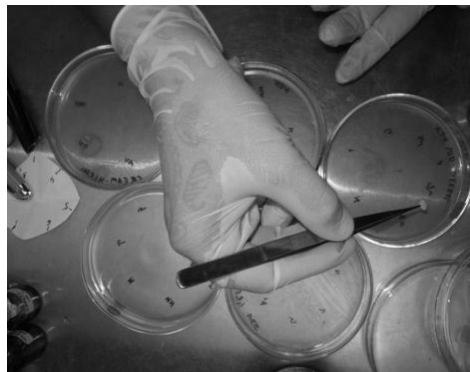
Figure 5: Antibiotic Sensitivity Plates