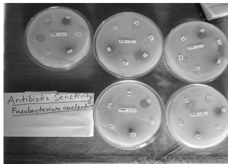
Figure 4: Antibiotic Sensitivity Test Using Herbal Extract Against Fusobacterium - Zone Of Inhibition can be Noted