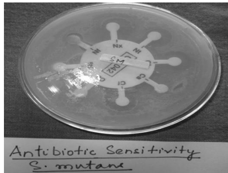
Figure 3: Antibiotic Sensitivity Test Using Commercially Available Antibiotic Discs Against Streptococcus Mutans - Zones of Inhibition can be Noted