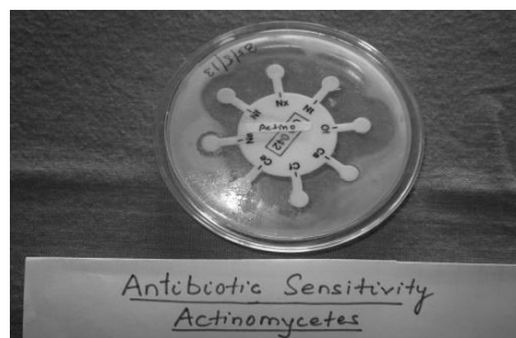
Figure 2: Antibiotic Sensitivity Test Using Commercially Available Antibiotic Discs Against Actinomycetes - Zones of Inhibition Can Be Noted