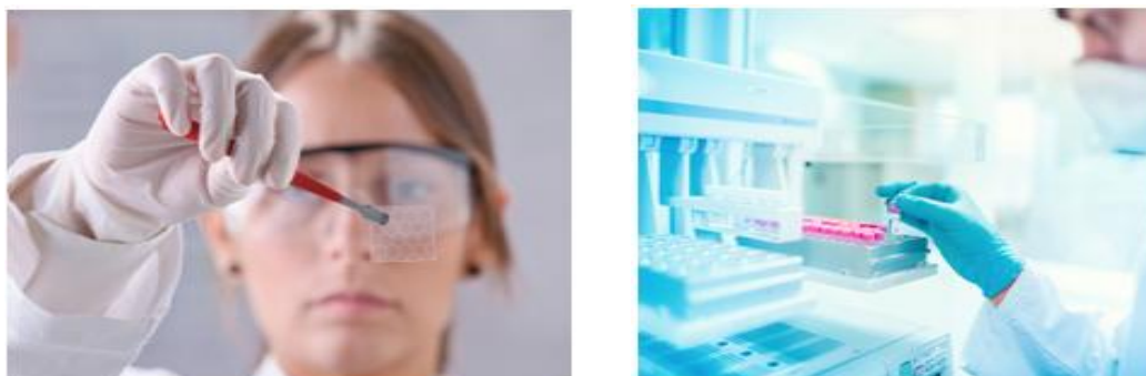
Figure 2: Graphene in medical field

The hazardous effect of graphene has lately been documented from several studies in addition to its broad application. The future strategy might attempt to eliminate the toxic effect while preserving the physical and chemical features [3, 5, 8, 9].