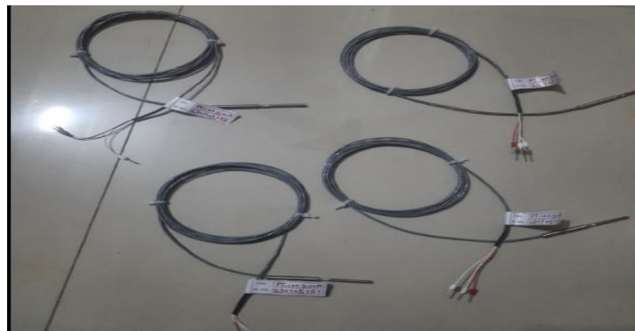
Figures 2: PT 100 Sensors used with multipoint temp indicator