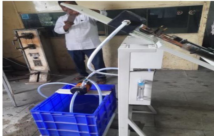
Figures 1: Experimental Setup

Experimental system consists of Heat Pipe with Copper oxide mixed with DI Water to absorb solar energy and that solar energy transferred to Recirculating water and converts in Thermal Energy and completes the cycle. The mass flow rate at inlet of Header is controlled by Rota meter. Inlet and outlet Temperature measured by Thermocouples.