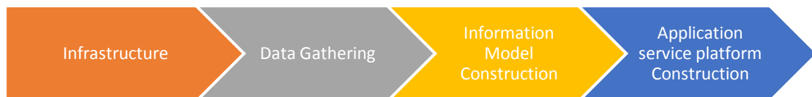
Figure 1: Framework of Digital Twin Technology

2. Framework of digital twin technology (Yao, 2021)[4]: The digital twin framework can be categorised in 4 stages (Yao, 2021)[4]