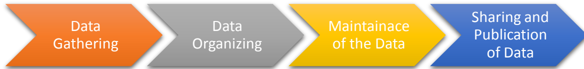
Figure 2: Information flow in Digital Twin Technology

3. Flow of data in information management in digital twin: Following Diagram shows the flow of data in Information management in Digital Twin