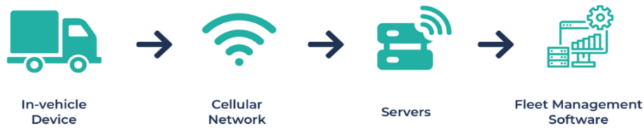
Figure 1: Basic Technology in Telematics