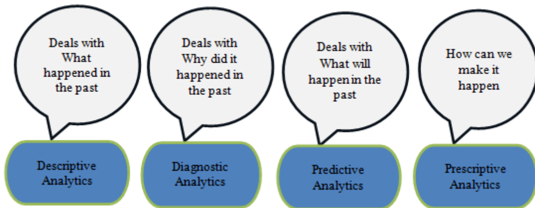
Figure 3: Big Data Analytics Techniques

Let's examine a few fundamental Big Data Analytics methods: