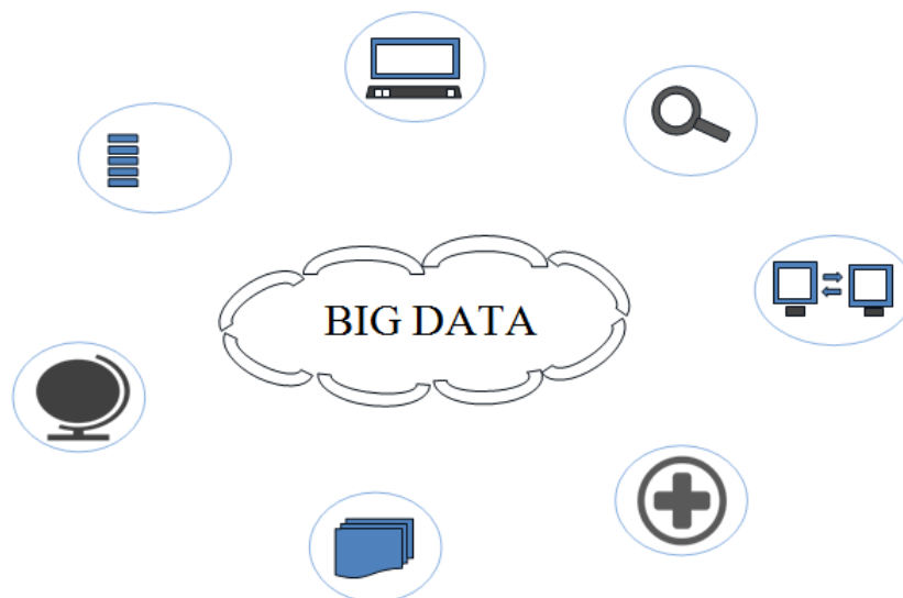
Figure 1: Big Data Usage

Example: Imagine a popular social media platform where millions of people post pictures, videos, and messages every minute. All this data combines to form Big Data!