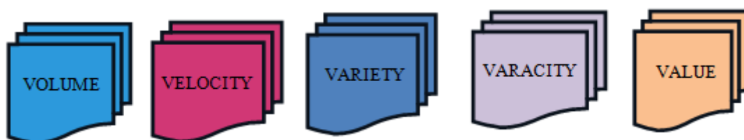
Figure 2: Characteristics of Big Data

Before Big Data has some special traits that make it different from regular data. These characteristics are like the superpowers of Big Data.