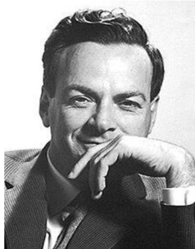
Figure 1: Richard Philips Feynman

versatile material with unique inherent properties for developing diagnostics, since they can be conjugated with various agents ..Because of its close interrelationships with other technologies, nanobiotechnology will play an important role in clinical diagnosis and development of nanomedicine in the future. Time will reveal the true picture.