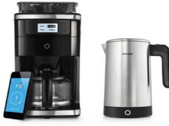
Figure 3: Smarter's iKettle 2.0 [3]

The iKettle 2.0[3] from Smarter allows users to boil water with a single click on their smartphone. Figure 3 depicts the product image. The WIFI password was simply given to the attacker with just one command while hacking this kettle, which was proven to be a severe security issue. As a result, an attacker can gain access to the network and intercept all data/money transactions, potentially compromising all other devices on the network. Fortunately, the producer discovered the flaw and corrected it in subsequent product models.