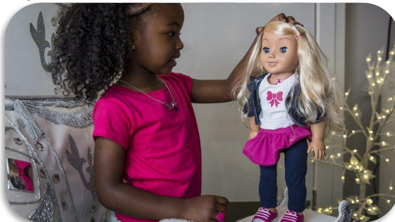
Figure 2: Cayla (Interactive Toy) [2]

Cayla (interactive toy) [2]: This toy is an interactive toy that can initiate a conversation with young children. The product image is shown in Figure 2. It has a microphone, a speaker, and Bluetooth that connects to your cell phone. The Bluetooth built into this toy did not have password encryption, effectively allowing anyone in the neighborhood to link to this device and spy on your kids. The toy can be made to swear by a simple change to the software. For this reason, this toy has gained popularity as “the swearing toy”. These concerns were raised, and this toy was quickly withdrawn from the markets of many countries.