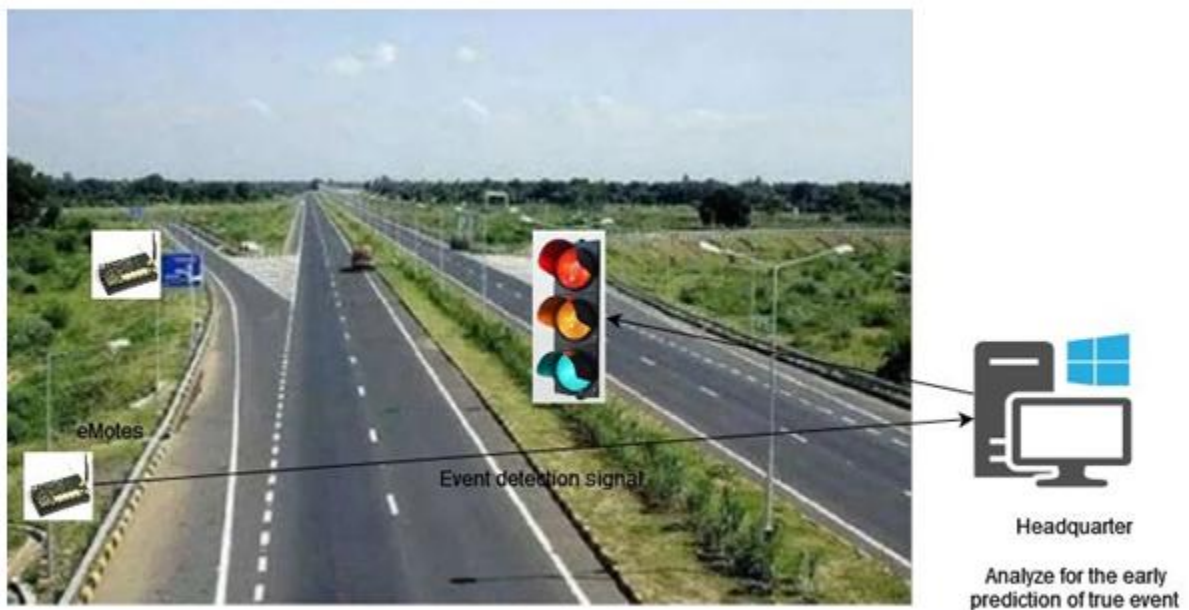
Figure 2: Vehicle protection system from wild Animals