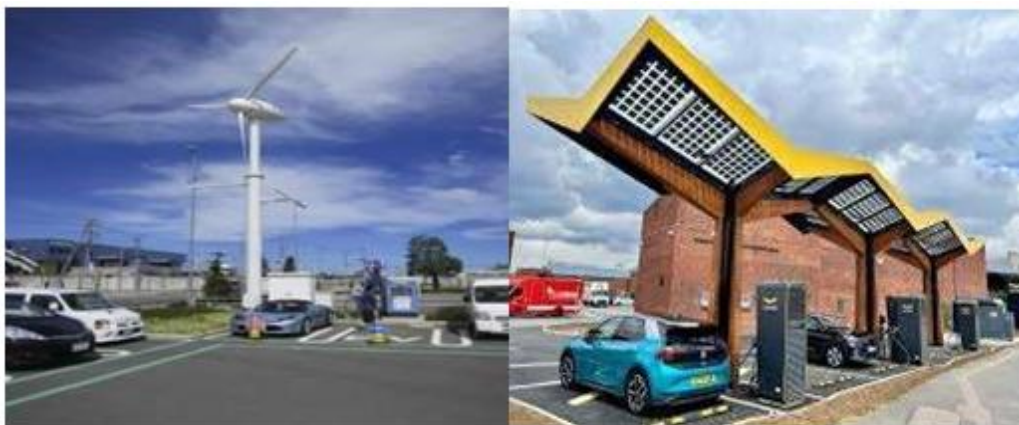
Figure 2: Renewable Energy Integration for EV Charging

Integrating these renewable sources with energy storage solutions like batteries and flywheel ensures consistent charging availability, even during bad and adverse weather or low renewable generation periods. Moreover, grid connectivity can be leveraged to sell excess renewable energy back to the grid, promoting a circular energy economy.