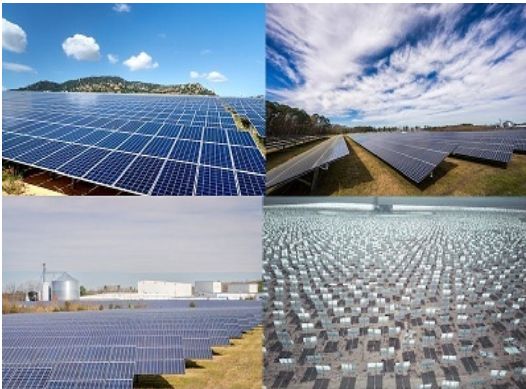
Figure 2: Solar Energy Types