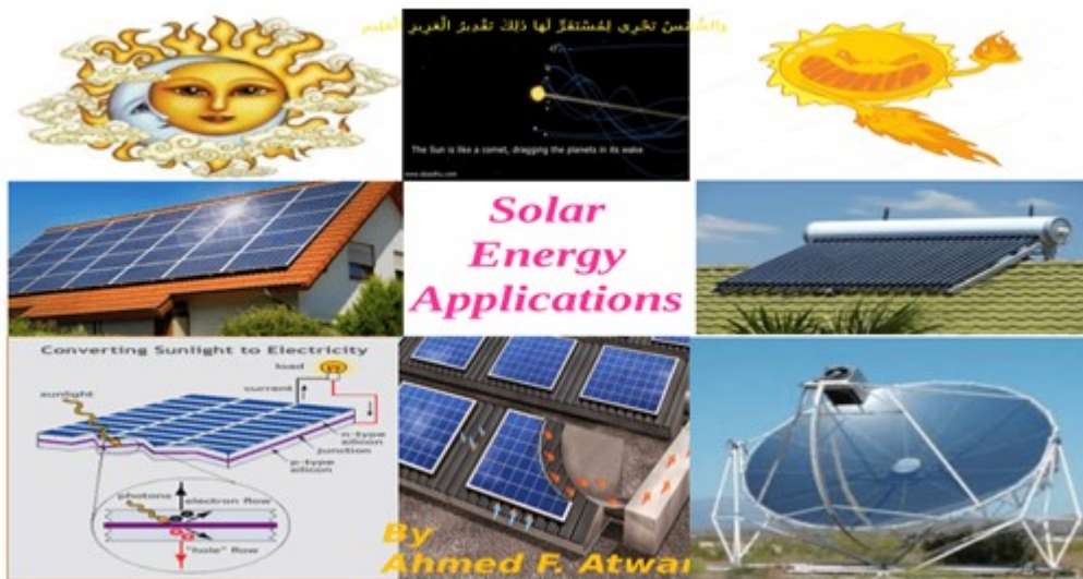
Figure 3: Solar energy applications