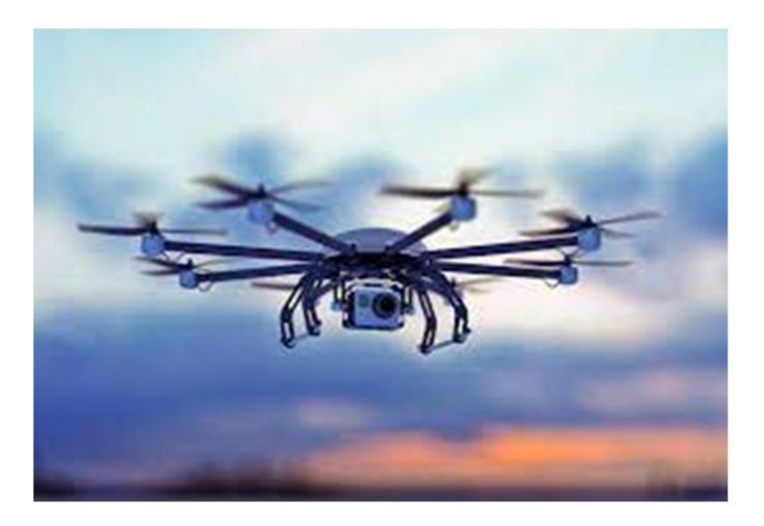
Figure 6: Embry-Riddle Worldwide [14]

The Inertial Measurement Unit (IMU) is an integral sensor found in survey-grade drones, serving to measure the drone's orientation and angular velocity. Typically comprising three accelerometers and three gyroscopes, the IMU accurately gauges linear acceleration and angular velocity. The collected IMU data plays a vital role in calculating the drone's precise position and orientation in three-dimensional space. By integrating this data with information from other sensors like the GNSS receiver and barometer, the drone can provide accurate positioning and altitude data for various applications.