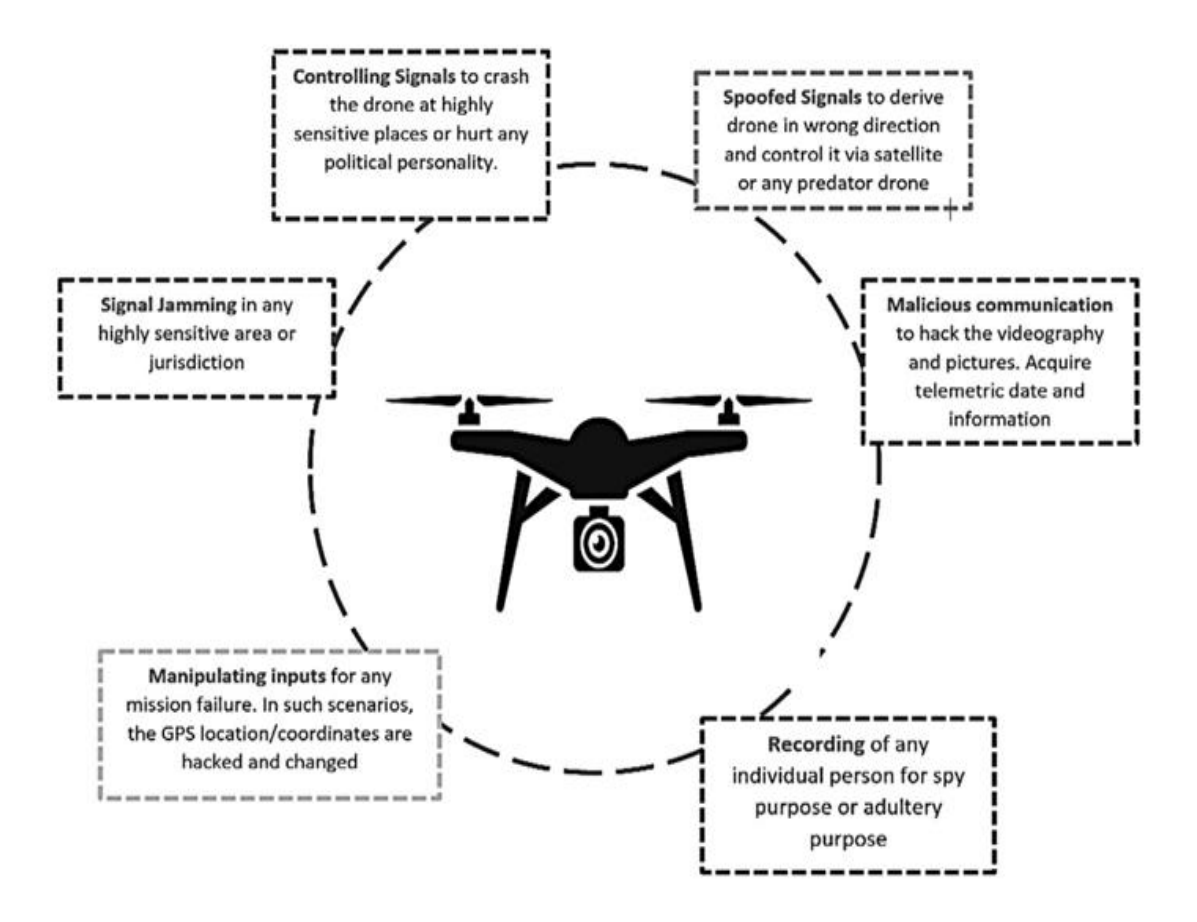
Figure 4: Security and privacy threats of UAVs[10]

In the transportation sector, sensors have played a significant role in enhancing safety and efficiency. For instance, automotive sensors are used in advanced driver-assistance systems (ADAS) to detect obstacles, monitor blind spots, and assist with parking. These sensors contribute to safer driving conditions by alerting drivers to potential hazards and even autonomously applying brakes in emergency situations. Additionally, sensors in public transportation systems can help optimize traffic flow, reduce congestion, and improve overall transportation management.