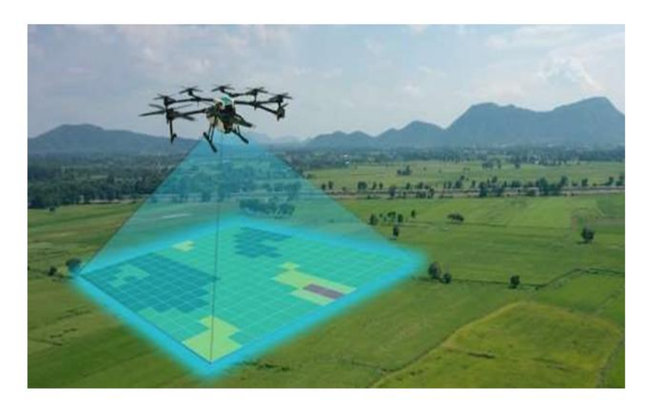
Figure 5: Drones in crop monitoring [12]

By employing these sensors, survey-grade drones can optimize their performance and achieve precise data collection for a wide range of applications. The accurate positioning, orientation, altitude, and imaging capabilities offered by these sensors contribute to the efficiency and effectiveness of surveying operations, enabling professionals to gather reliable data and make informed decisions in various industries such as land surveying, infrastructure inspection, environmental monitoring, and agricultural analysis.