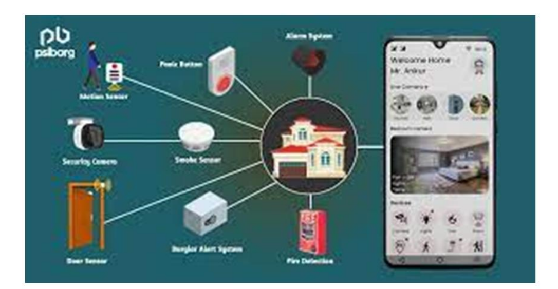
Figure 1 : IoT in Home Security[1]