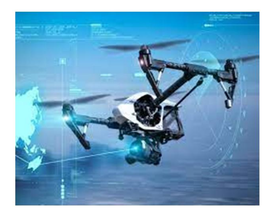
Figure 7: Connectivity Solutions For Autonomous Flying[16]