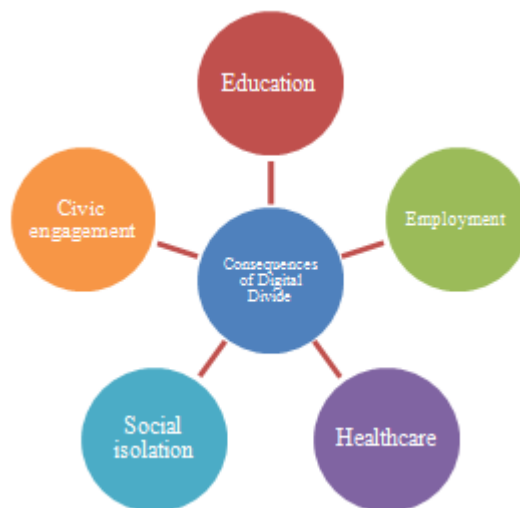
Figure 2: Consequences of Digital Divide