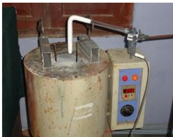
Figure 2: Photograph of experimental technique

The first component is the bottom section, which has a 0.5 mm-diameter micro air nozzle and a compressed air intake. This is the crucial component of the nebulizer. This nozzle behaves like a jet air nozzle and exhales air at a very high speed when air at high pressure is applied through it. This explains why the device is called a "Jet Nebulizer." The first half of the Jet air nozzle is installed in the second section, a specifically made liquid sucking unit with a tiny hole and a striker target tip in the top portion. The third one is the top section, which has a 1 cm diameter tube running from top to bottom as well as an exit for releasing aerosols. Figure 1.2 is a snapshot of an experimental Jet Nebulizer setup.