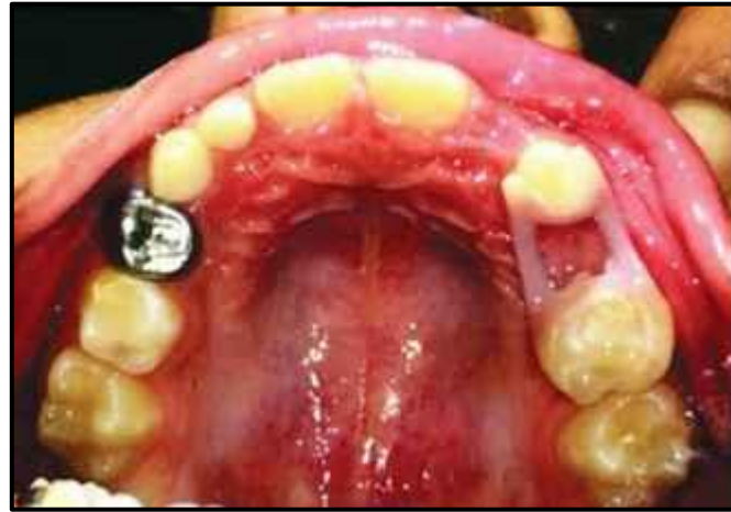
Figure 2: Six month follow-up of appliance, by HK Soni 34

and helped in even distribution of masticatory forces delivered across the extracted tooth area. Six months follow up results were satisfactory.