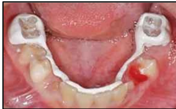
Figure 1: Case report, Gaetano Ierardo using PEEK as a space maintainer 26

A 9- month follow-up study using PEEK polymer was done by Ierardo et al on three patients for making a CAD-CAM space maintainer. 26 They fabricated a lingual arch, a band and loop, and a removable space maintainer and obtained satisfactory results. Digital band and loop space maintainers made of PEEK polymer were assessed by Kun et al. 27 in children with unilateral loss of either the first or second molars and were found to be 75% lighter than conventional space maintainers. In an in vitro investigation, Guo et al. 28 compared digitally made Removable Space Maintainers made with PEEK polymer to conventional Removable Space Maintainers (RSMs). Study results showed removable space maintainers made by digital method showed better fit, thus indicating that the technique can be used in various clinical applications. 28 This is mainly because the conventional technique of making has many steps which can bring about faults during polymerization shrinkage of self-curing resin and there is a need to grind and polish removable space maintainers, which is not needed in case of digitally made removable space maintainers.