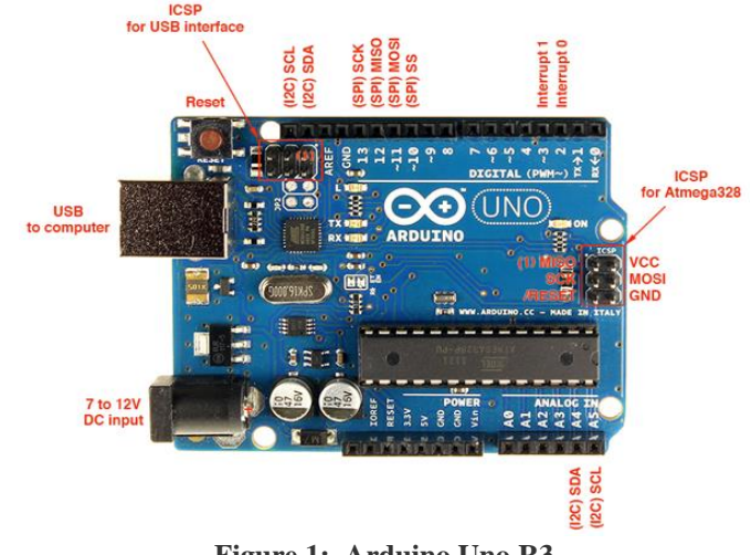
Figure 1: Arduino Uno R3

or any other microcontroller board. Since these operate at very low voltages, we can't directly connect electrical devices with these boards. With the help of the relay module, we can connect the microcontroller board and electrical devices together in a circuit. With the help of the microcontroller boards along with the relay, we can turn on/off the devices operating at 230 volts.