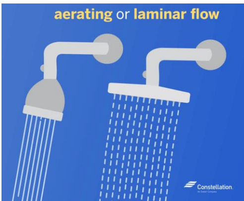
Fig 1: aerating and laminar flow [31]

These are the way to reduce through taps and toilets using municipal water supplies. But some households will have their own natural well to draw water from it. So here are some techniques to refill and reuse the natural aquifers.