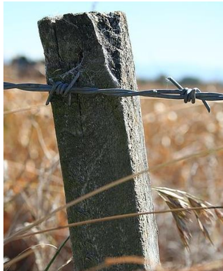
Figure 2: Illegal Fence identification

Most of the deaths occurred because of shocks coming from broken electric lines. Indeed, even the fences that have been gotten up in a position produce creatures ending their lives. The vast majority of the electric fences are working without the information on Electrical Inspectorate[7]. Deaths because of electric shock can be forestalled by setting up an electric fence energizer. However, without this, highvoltage power will be communicated straightforwardly to the fence killing animals. The illegal power fences and set up uninsulated wire perimeters edges around their farm, and charge them utilizing their legal meter connections. Delicate creatures like tigers, bears, and leopards face instant death after coming in contact with them[11,12].