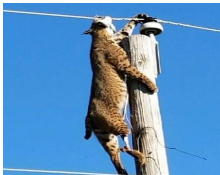
Figure 1: Electrocution on distribution power lines

At the point when a suitable electric flow is gone through the body of animal into a state called as ventricular fibrillation. This react to cardiac arrest happen that implies heart beating and immediately end the pumping blood [1]. wild animal got collapse while touching the fence and become no movement of action ,it leads to death. Electrocution affects the life of wild animals .This may be caused by faulty electrical circuit connections, lightning fallen in the electrical line.