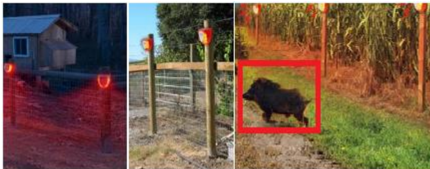
Figure 4: Wild animals detection with alarm warning with flicker flame lights

Latest Designed Flickering effect with a Safe alternative as Real Flickering Flames Design [10]. The solar post light with automatic photosensitive design including waterproof and heat resistant. Flickering Solar Lights Outdoor having facilities such as Energy saver and Simple disassembly. Robust Glass Material with Shock resistance with Rough Handling and Auto On/off From day to midnight [8,9].