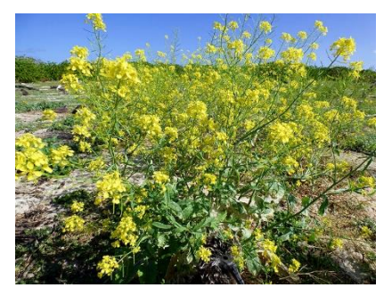
Fig.3. Brassica juncea

Phytoremediation has been used successfully to clean up contaminated sites, such as abandoned industrial areas and landfills. It has also been used to treat wastewater and air pollution. White