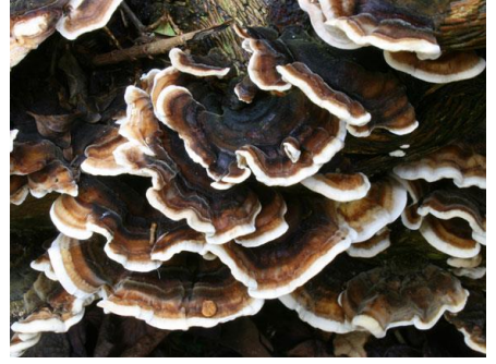
Fig.2. White rot wood fungus

Highly used fungi are mushrooms of different kinds and white rot wood fungus (Fig.2). These help in bioremediation by degrading lignocelluloses using extracellular enzymes. They can also be grown on any carbon source, which will be utilized and bio-transformed into other simpler substances. Furthermore, advances in Recombinant DNA technology and Genetic engineering have opened up new possibilities for improving the efficiency and specificity of bioremediation using bacteria and fungi. For example, they can be engineered to produce enzymes that break down specific substances and can be further exploited.