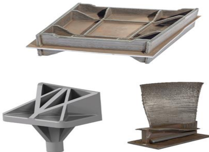
Figure 2: WAAM processed components

Immediate Feedback: Any detected defects or irregularities trigger alerts or adjustments in real time. The manufacturing process can be paused, modified, or corrected to prevent the propagation of defects to subsequent layers. The thermal imaging data can be stored for each layer, creating a comprehensive record of the manufacturing process and defects detected. This documentation aids in quality assurance, analysis, and process optimization[15].