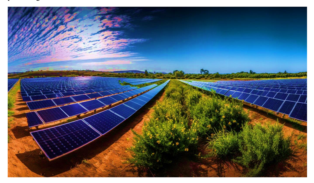
Fig 1. Photovoltaic Systems

Water pumping serves as a vital lifeline across various sectors, sustaining agricultural productivity, industrial processes, and community water supply. However, as global concerns over climate change and environmental impact intensify, traditional water pumping methods relying on fossil fuels or grid-connected electricity face scrutiny. In response to these challenges, the integration of photovoltaic (PV) systems for water pumping has emerged as a promising and transformative solution.