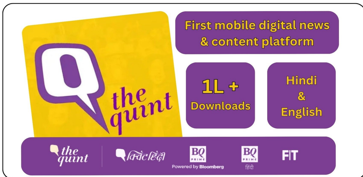
Fig. 2 Logo of the quint with some key features

One notable case study that exemplifies entrepreneurship in the Indian media industry is the story of The Quint. Founded in 2014 by Raghav Bahl, a renowned media entrepreneur, The Quint has emerged as a leading digital media platform known for its innovative approach to news and storytelling.