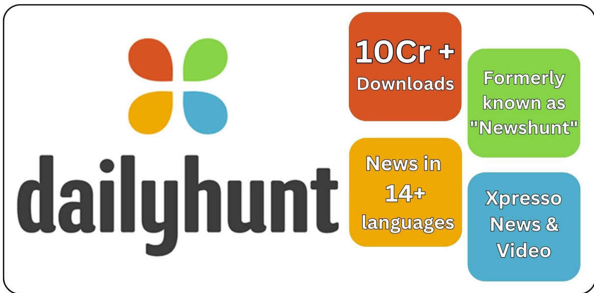
Fig. 3 Logo of dailyhunt with some key features