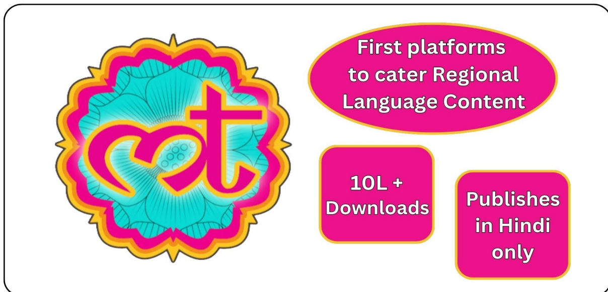
Fig. 6 Logo of Lallantop with some key features

Lallantop is a prominent digital media platform in India that has reshaped the landscape of news and entertainment through its entrepreneurial approach. Launched in 2016 by Alok Bhardwaj and Saurabh Dwivedi, Lallantop has gained popularity for its unique content offerings and innovative storytelling techniques.