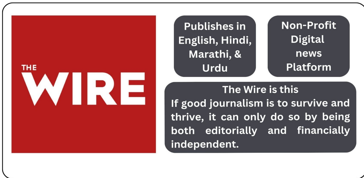
Fig. 5 Logo of The Wire with some key features

The Wire is an independent digital news platform in India that has made a significant impact on the country's media landscape through its entrepreneurial journalism approach. Founded in 2015 by Siddharth Varadarajan, Siddharth Bhatia, and M.K. Venu, The Wire has gained recognition for its investigative journalism, in-depth reporting, and commitment to journalistic ethics.