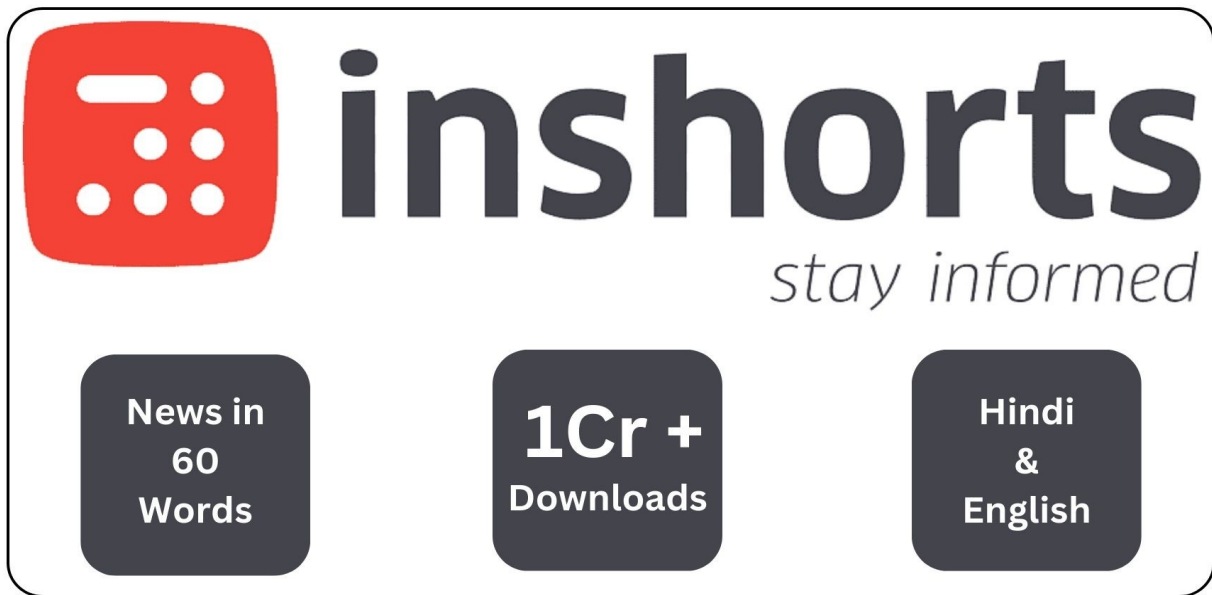
Fig. 4 Logo of inshorts with some key features

Inshorts, formerly known as News in Shorts, is a pioneering digital media platform that has revolutionized news consumption in India. Founded in 2013 by Azhar Iqbal, Deepit Purkayastha, and Anunay Arnav, Inshorts has emerged as a disruptive force in the Indian media industry through its innovative approach to news aggregation and delivery.