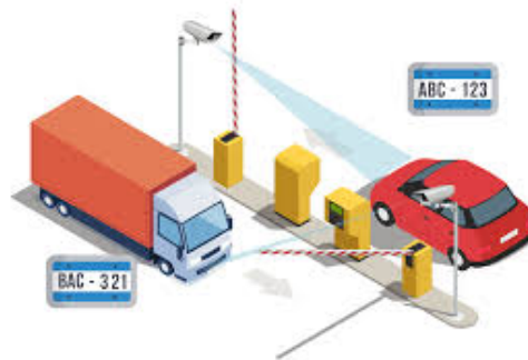
Fig 2: Automatic Number Plate Recognition (ANPR) with barrier gate

[7] This article discusses the importance of situational awareness in security and the challenges of achieving it at different spatial and temporal scales. Smart video surveillance systems have the potential to improve situational awareness, but the technologies within them are currently being developed independently. Achieving comprehensive situational awareness requires multi-scale spatiotemporal surveillance, which can be achieved through real-time video analytics, active cameras, multi-object modelling, and pattern analytics long-term.