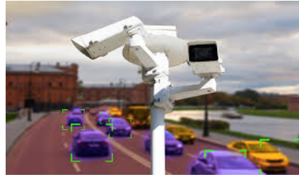
Fig 1: Monitor traffic violations with video analytics [www.briefcam.com]

This paper presents a random multi-class vehicle classification system. based on the rear view of the car. The system classifies vehicles into one of four classes using a set of taillight characteristics and vehicle size, processed by a hybrid dynamic Bayesian network. The system was tested on a database of 169 videos and achieved high classification accuracy.