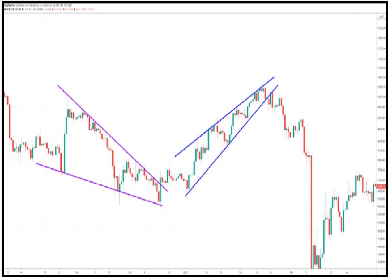
Figure 3: Graph showing the denominations of cryptographic currencies