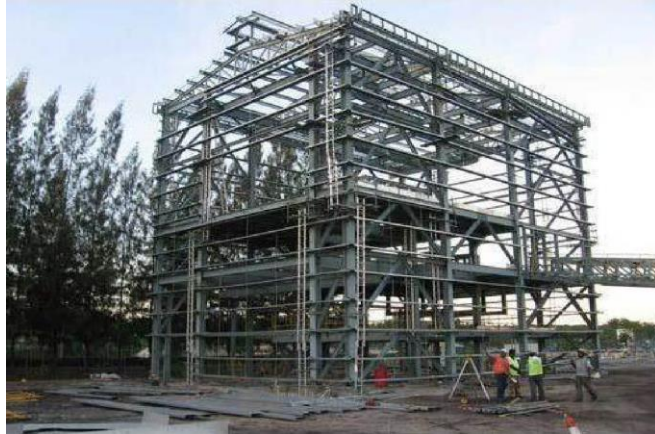
Fig 1: Steel structure installation