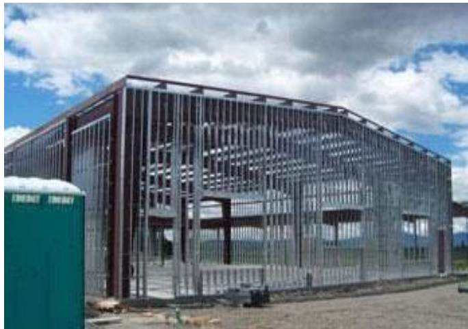
Fig 2: Example of structural design for LGSF Construction

All across the world, steel is a building material that is used extensively. The usage of reinforced concrete, structural brickwork, and timber are preferred over steel, which is seen to be uneconomical for landed properties. Cold framing is a technique that was utilized to create the affordable steel frame, which is now used in many nations. It is a high-tech building material intended for the construction of prefabricated buildings and other structures. In order to maximize utility space, LGSF technology uses high-quality galvanized steel profiles in load-bearing walls, interior walls, floor slabs, and roofing frames. Since the light gauge steel is created using the cold formed technique without the use of heat, the makers are able to generate light weight but highly tensile steel sheets. These steel sheets are created by first treating metallic scrap and then going through the cold-forming process. The c- or s-shaped parts of the steel are created by passing thin sheets of the metal through a series of rollers (of varying shapes). The sheet surface is then thoroughly covered and rendered corrosion-resistant by applying a zinc alloy coating. The steel frame buildings are strong and can last for up to 50 years.