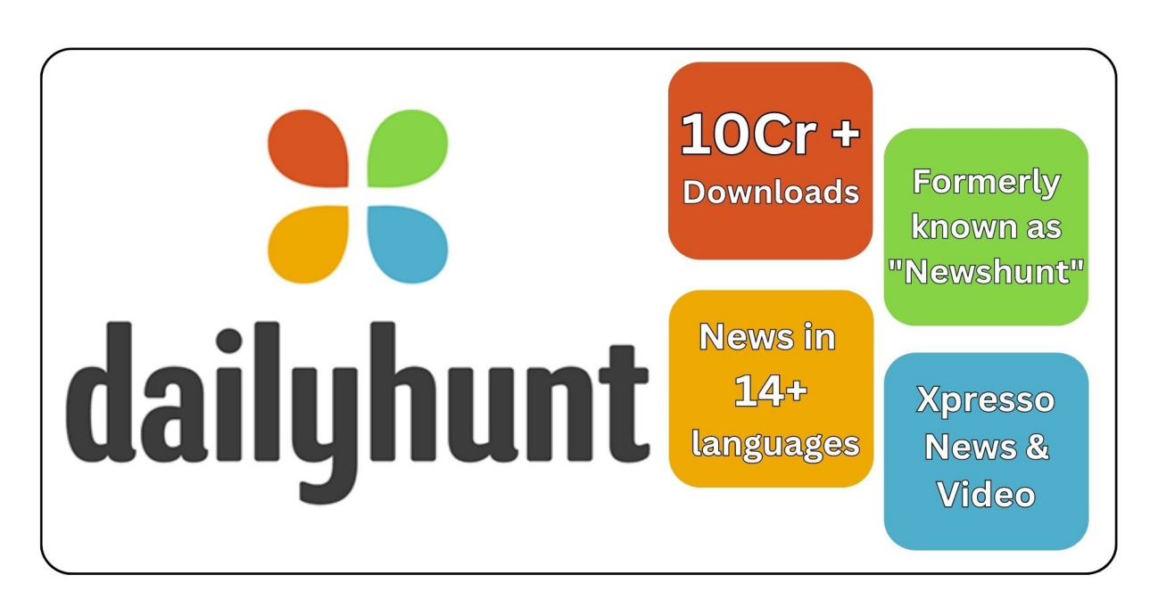
Fig. 3 Logo of dailyhunt with some key features