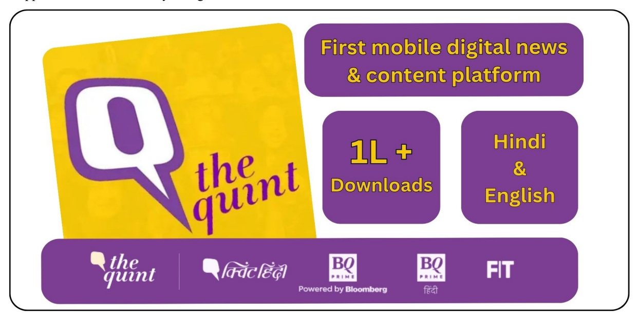
Fig. 2 Logo of the quint with some key features

One notable case study that exemplifies entrepreneurship in the Indian media industry is the story of The Quint. Founded in 2014 by Raghav Bahl, a renowned media entrepreneur, The Quint has emerged as a leading digital media platform known for its innovative approach to news and storytelling.