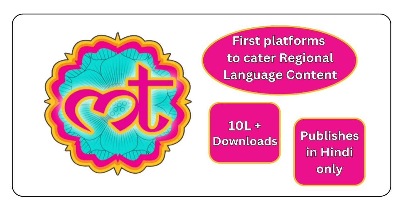
Fig. 6 Logo of Lallantop with some key features

Lallantop is a prominent digital media platform in India that has reshaped the landscape of news and entertainment through its entrepreneurial approach. Launched in 2016 by Alok Bhardwaj and Saurabh Dwivedi, Lallantop has gained popularity for its unique content offerings and innovative storytelling techniques.