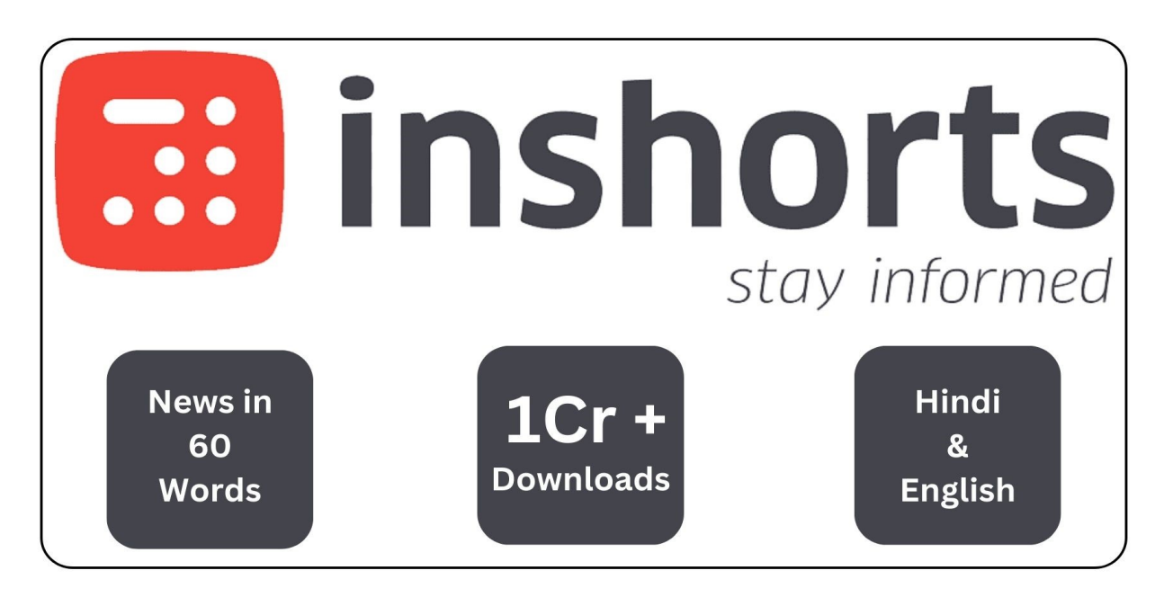
Fig. 4 Logo of inshorts with some key features

Inshorts, formerly known as News in Shorts, is a pioneering digital media platform that has revolutionized news consumption in India. Founded in 2013 by Azhar Iqubal, Deepit Purkayastha, and Anunay Arnav, Inshorts has emerged as a disruptive force in the Indian media industry through its innovative approach to news aggregation and delivery.