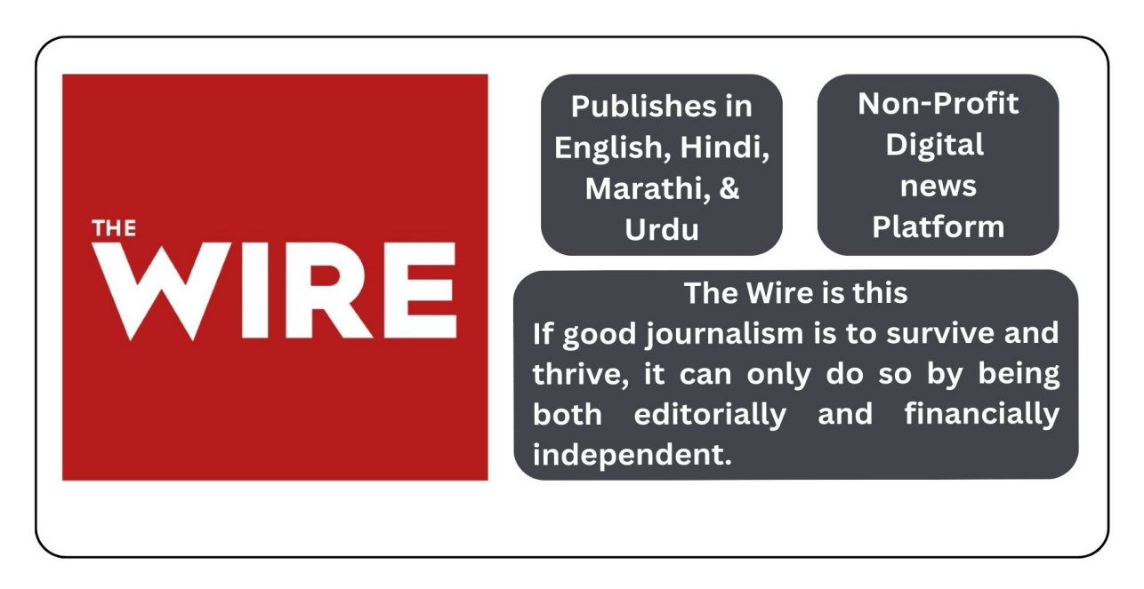
Fig. 5 Logo of The Wire with some key features

The Wire is an independent digital news platform in India that has made a significant impact on the country's media landscape through its entrepreneurial journalism approach. Founded in 2015 by Siddharth Varadarajan, Siddharth Bhatia, and M.K. Venu, The Wire has gained recognition for its investigative journalism, in-depth reporting, and commitment to journalistic ethics.