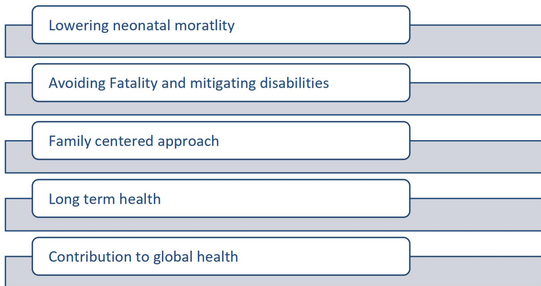
Figure 1: Components of Neonatal Care

Because it directly affects the health, well-being, and future of babies, neonatal care is of utmost importance in the field of healthcare. The neonatal period, sometimes known as the first 28 days of life, is a crucial stage characterized by notable developmental changes and a high degree of fragility. During this time, a newborn's physiological systems are changing from the safe intrauterine environment to the difficulties of the outside world. Despite being a natural process, this shift can be complicated and risky, necessitating specialized care.