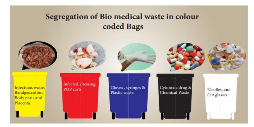
Color coding & type of container for disposal of bio-medical waste

It is mandatory to collect and segregate waste at the site of the generation itself to avoid any spillage or risks afterward. Furthermore, it also ensures effective waste disposal. The aim is to keep injurious and infected waste materials separate from the non-contagious waste. For easy segregation, colored <u>biomedical waste containers</u> such as <u>pedal bins</u> and non-chlorinated plastic bags are widely used. Color coding of biomedical waste containers is – yellow, red, blue and black.