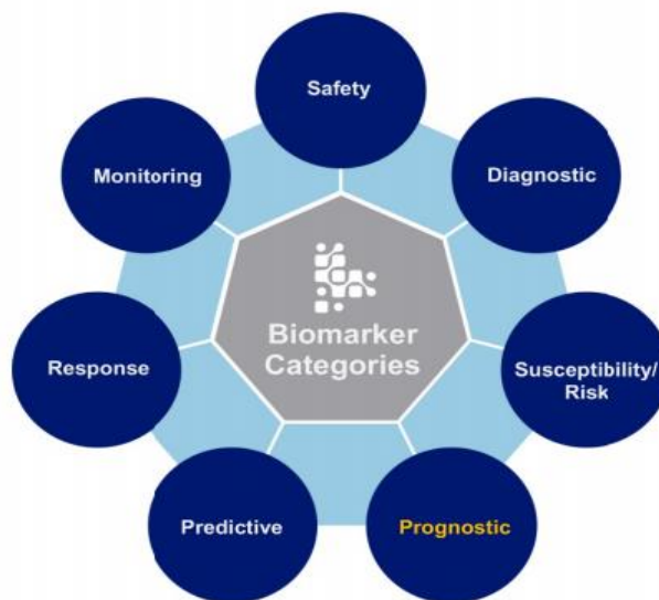
Figure 3: Different Category of Biomarkers