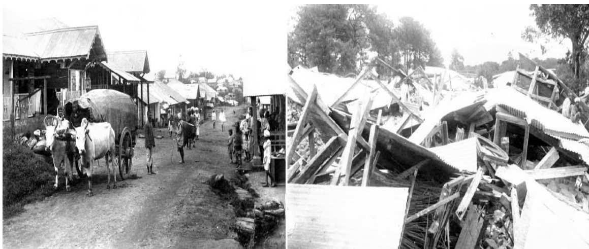
Figure 4. The Shillong Bazaar before and after the earthquake 1897 (Oldham 1899).