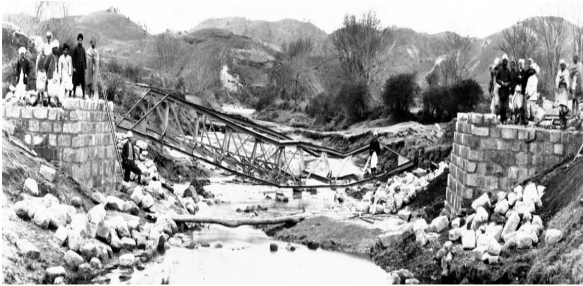
Figure 5. Shillong bridge toward Dawki: Impact of Earthquake 1897