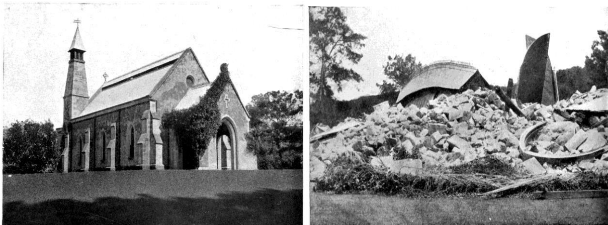
Figure 3. Shillong Church before and after the Earthquake 1897 (Oldham 1899)