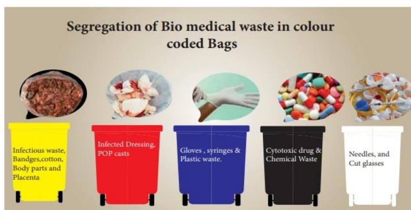
Color coding & type of container for disposal of bio-medical waste

It is mandatory to collect and segregate waste at the site of the generation itself to avoid any spillage or risks afterward. Furthermore, it also ensures effective waste disposal. The aim is to keep injurious and infected waste materials separate from the non-contagious waste. For easy segregation, colored biomedical waste containers such as pedal bins and non-chlorinated plastic bags are widely used. Color coding of biomedical waste containers is – yellow, red, blue and black.