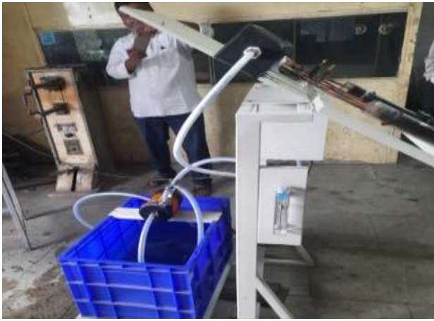
Figures 01 Experimental Setup